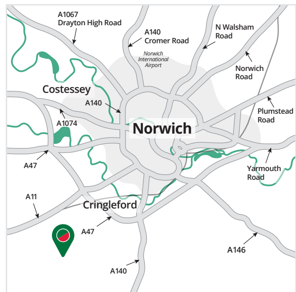
Rectory Road, East Carleton, Norwich, Norfolk NR14 8HT.

We are actively looking for franchisee operators to complete the coverage of our network and join in the increasing success of the company.